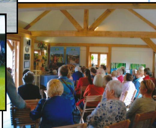
Flower Arranging demonstration by Florabundance, in the Information Centre