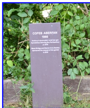
The Memorial Plaque in-