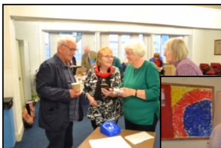
Collectables, bottle stall in action.