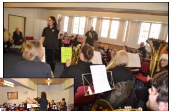
Menai Bridge Training Band. Threnody Choir below.

We decided that it would be appropriate to donate our profits from the Coffee Morning to the Anglesey Food Bank and other local charitable groups. We have given £300 to the Food Bank and £75 to the Band and Choir. We hope that the Garden Party will return next year i.e. 2023, this time probably in the summer.