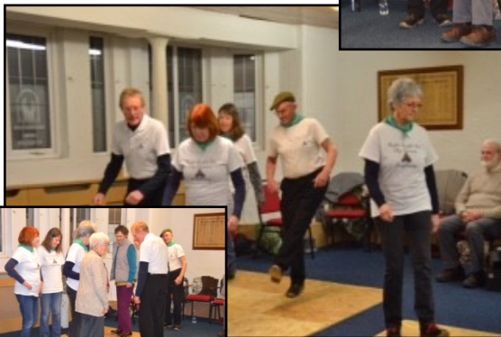
Migldi Magldi Môn

stepdance/ Dawns stepio or Cloccio) is stylistically distinct from English clog dancing with new steps and "tricks" constantly being invented. Welsh clog dancing, especially solo dancing has evolved to become much more dynamic than English clog dancing. Not to be confused with Welsh Folk dance (Dawnsio Gwerin)