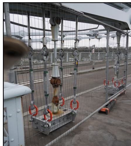
Bridge supports April 2023

I hope that's now clear and you are reassured at the expertise available and that work will be completed promptly, or perhaps you're not?