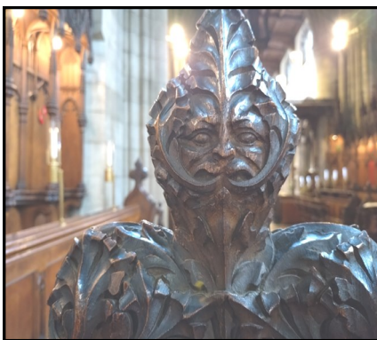
'Green man' - detail from the end carving on the Choir stalls

the Albert Memorial, and the Foreign and Commonwealth Office amongst many others.